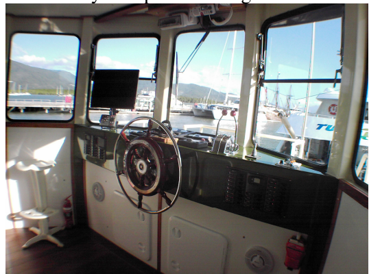
Great visibility from the helm