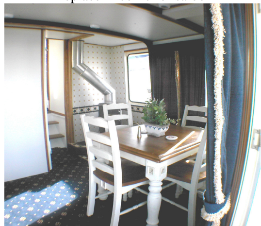
Comfortable room for 4 at table