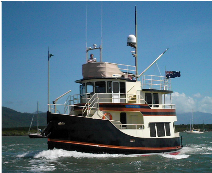
Underway, port side – note stairs to boatdeck.