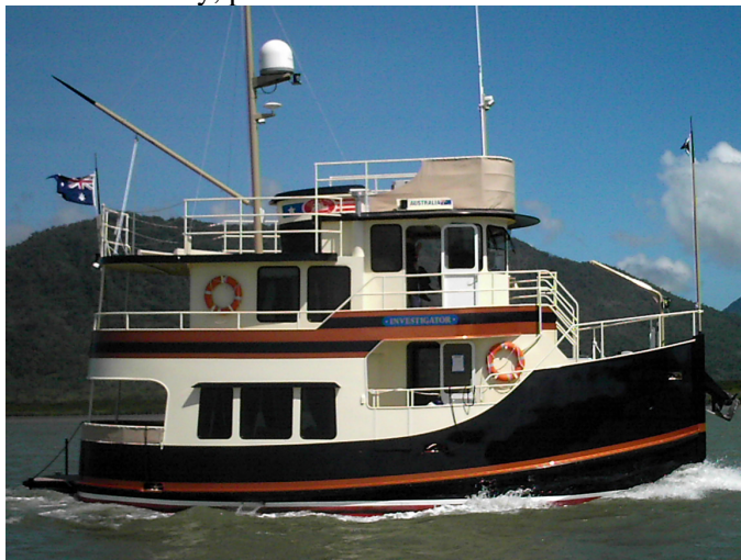
Underway, starboard side