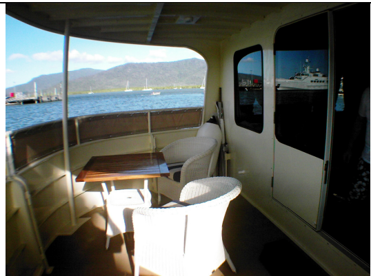
Roomy cockpit for dining al fresco