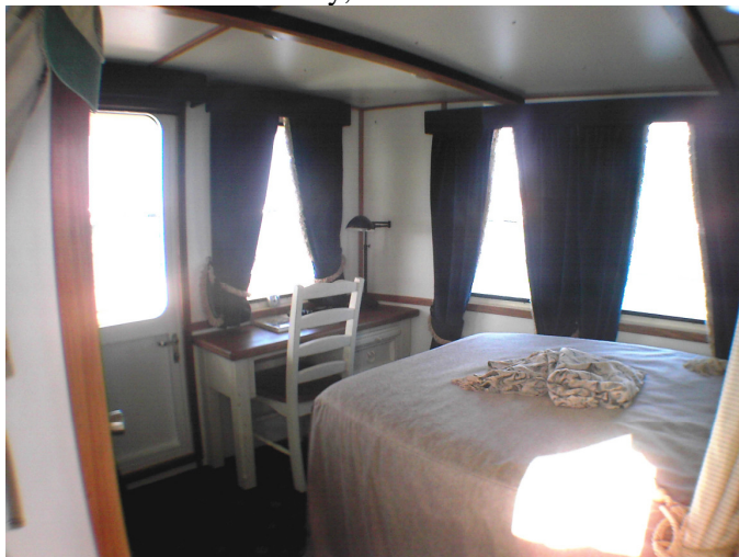
Master stateroom with double berth, desk/dresser aft, head enclosure to left in photo