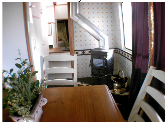
Fireplace in corner of saloon