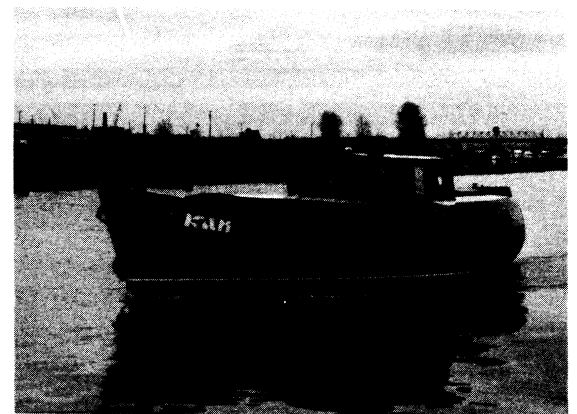
K'AN running cleanly at launching-day trials.